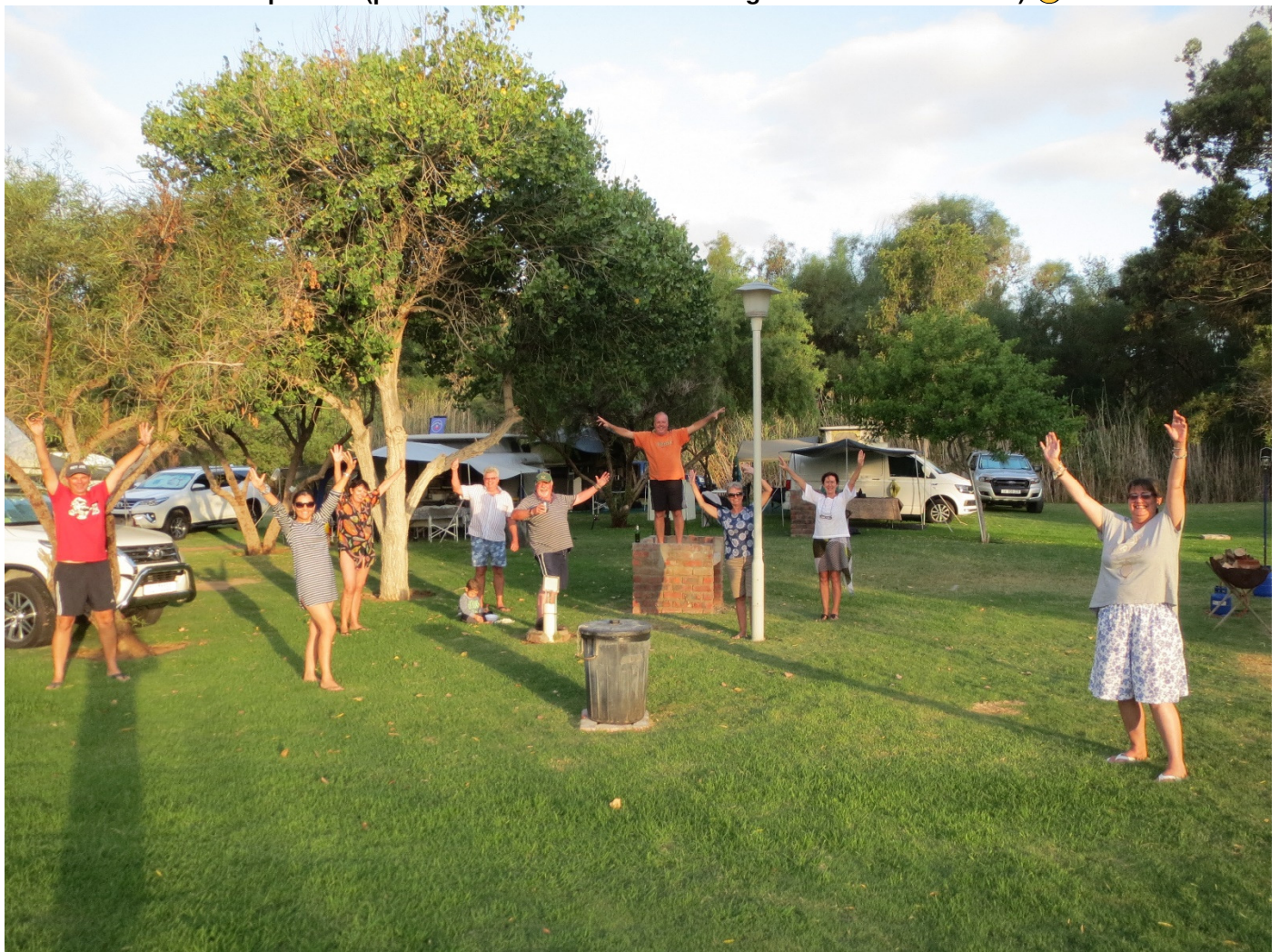
Group Photo (please note that social distancing rules were adhered to) 😊

Thank you everyone for a nice camp, hope to see you in May at Ganzekraal.