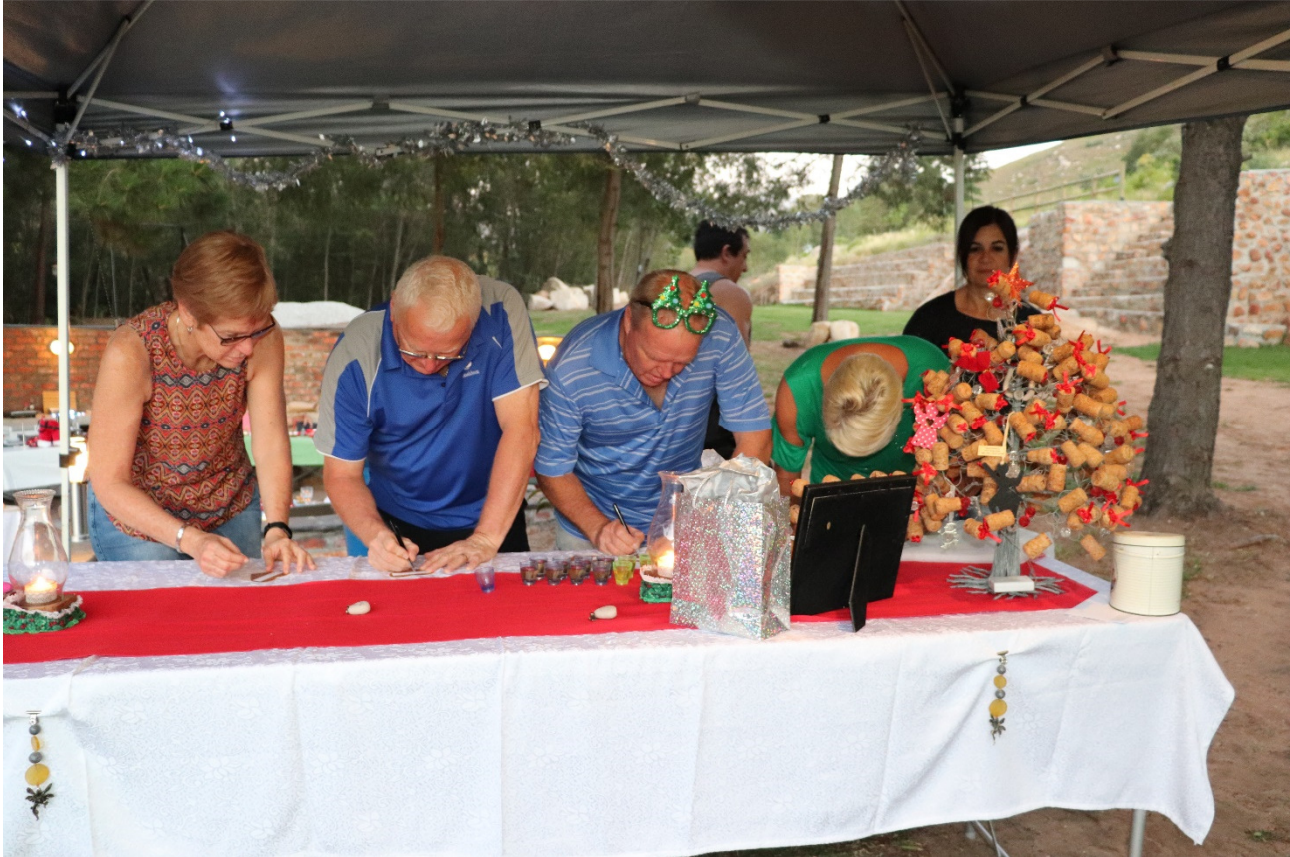
Guessing the number of corks