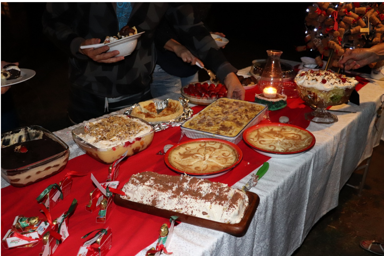
Potluck Pudding table.